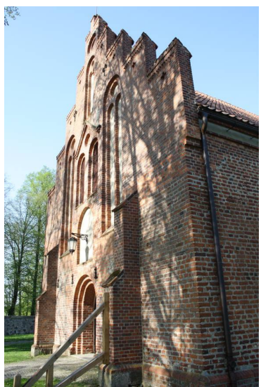
Fig. 1. Holly Mother of Lipsk Sanctuary – entrance

This paper focuses on the results of a research conducted in the village of Lipy situated in the Warmińsko-Mazurskie province of Poland. The village was named after a lime tree that grew there in the 13th century, under which the Prussian community inhabiting the area prayed to the goddess Majuma. According to a local legend, once, when the local people were saying their pagan prayers, the Holly Mother appeared in the tree [8]. To commemorate this miraculous event, a wooden church was built. It was later destroyed and in 1626 it was replaced by a brick building. In 1861, the church burnt down. In 1870, a new church was built in the neo-Gothic style, which survived to our times (Fig. 1). Gradually, more and more houses were built around the church to finally form a village. Currently, the church is known as the Holly Mother of Lipy Sanctuary, and is popular among pilgrims from all over the country [9]. The village is currently inhabited by people who have nothing to do with farming. Most of them work in industrial plants in the nearby town of Lubawa. Nevertheless, the village has retained its idyllic climate.